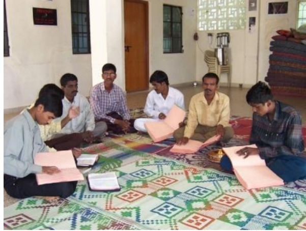
A Bible study session at the camp for visually impaired people held by the Bible Society of India in Bangalore.

"I have learnt not to blame God for the difficulties I face in life. I will overcome temptations by the help of God."