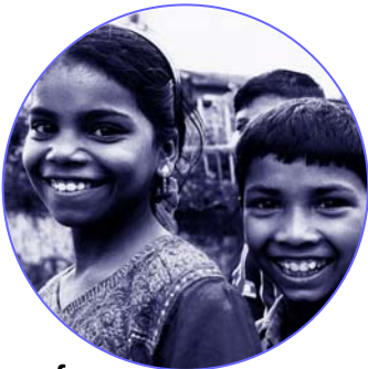
Children from Gujarat, India

The Bible Society in India plays the cassettes of Scripture for a whole village to hear. In an area, where people speak the Telugu language, the average church almost doubles its attendance in the first two months. The Word of God is having an amazing impact!