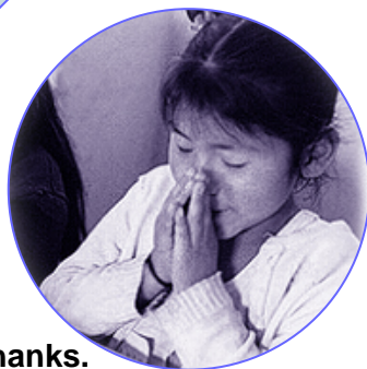
Giving thanks. Lima, Peru

The Bible is still as important to Christians today because we believe that the writers were inspired by God. This is why it has been given names like 'The Word of God' and 'The Holy Scriptures'.